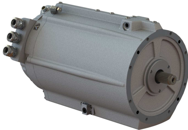
Electric Traction Motor